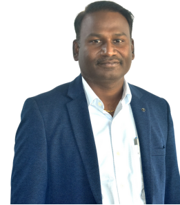
M Nagarajan IAS Collector and District Magistrate, Mehsana, Gujarat

In this era of interconnectedness and interdependence, globalization has transcended from being an option to an imperative for Indian startups. The evolution of communication, logistics, and cross-border trade has bestowed upon startups unprecedented access to international markets, unlocking a realm of opportunities for scaling operations and amplifying revenue streams. The emergence of Indian unicorns as global ambassadors is emblematic of this paradigm shift.